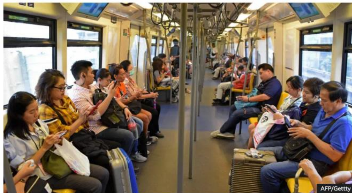
People across the globe are often glued to their mobiles